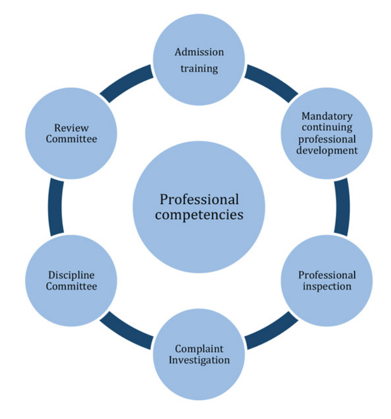
Diagram 2: The Central Concept of Professional Competency

Taking inspiration from the changing standards governing the continuing development of professional competencies and promoted best practices,<sup>33</sup> it is possible to suggest that the reflective approach has the advantage of making each professional's mandatory continuing professional development meaningful, insofar as it is based more on the foundations of modern adult-learning theory.<sup>34</sup> This newfound meaning comes about from upholding the typical characteristics of adult learning, including self-determination, described by Rivard and Lauzier as follows: