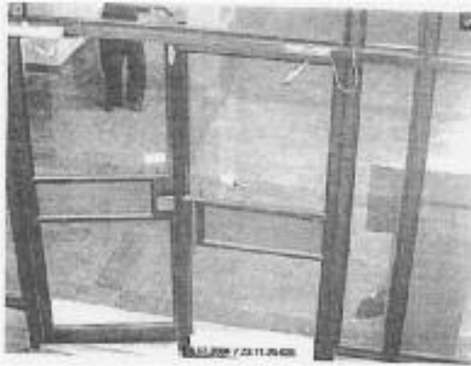
Figure 1: Relatively unobstructed sample CCTV image of shooter's lower limbs

This image is taken from the court record in R v Aitken (BCCA Registry number CA36854, Victoria). It corresponds to Exhibit 17, Tab 2 at 102. CCTV footage date and time stamp 28.12.2004/23:11:25:026.